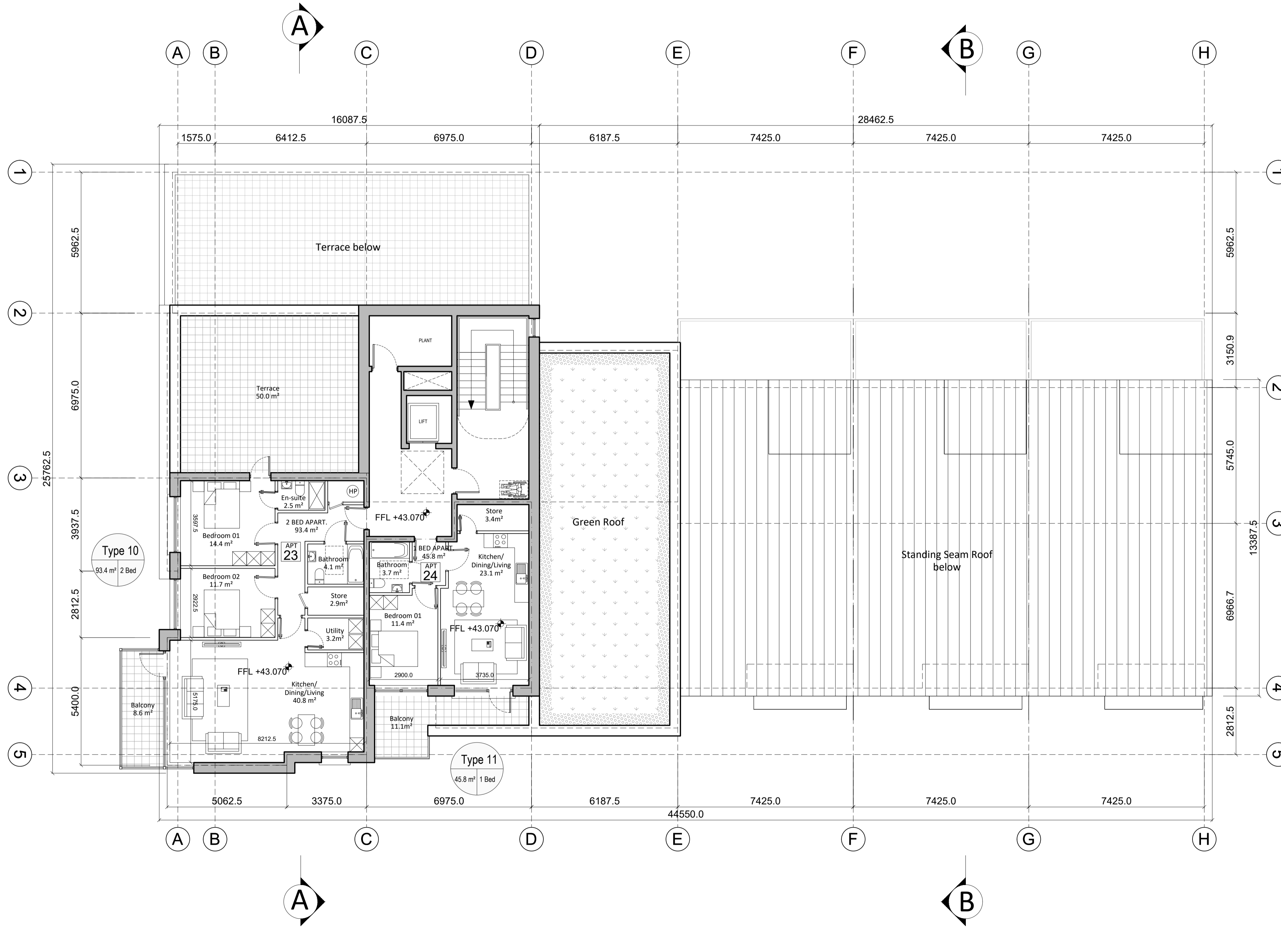
Fifth Floor Plan

NOTE: Do not scale from this drawing, written dimensions only to be used. This drawing is for planning purposes only & not for construction. Levels shown are for information purposes only & may not relate to O.S. Malin Head Datum. For actual O.S. Malin Head Datum always refer to the Site Layout Plan. DDA Architects Ltd. retain copyright and ownership of this design which is not transferable.